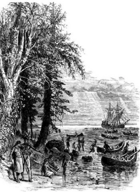
THE BEGINNING OF TRADE ON THE HUDSON.